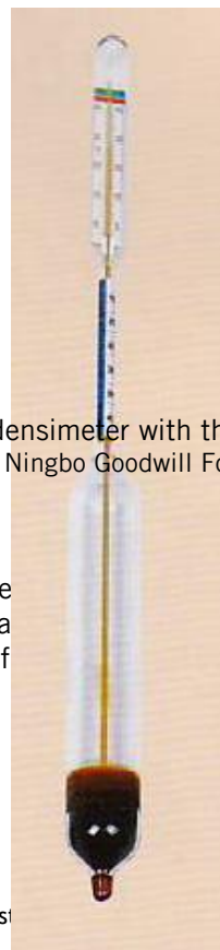
Figure 2: Lacto-densimeter with thermometer