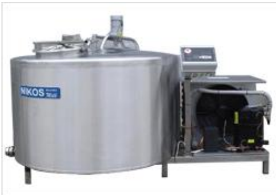
Figure 3: Milk cooler

Cooling does not destroy bacteria or enzymes but it slows down their activity. Cooled raw milk keeps its quality for a few days before it is processed. Milk products such as yoghurt, cheese, butter and pasteurised milk are also cooled to ensure they have the required shelf life for distribution to shops and retail storage. At the smallest (micro-) scale of operation, a refrigerator set at 4-5°C can be used to cool milk, but most dairy processors use a milk cooler (Figure 3) or cold store to cool milk in bulk before it is processed. Finished products should be stored in a separate dispatch store at 4°C +/- 2°C, or for frozen milk and ice cream, frozen in a freezer operating at below -18°C.